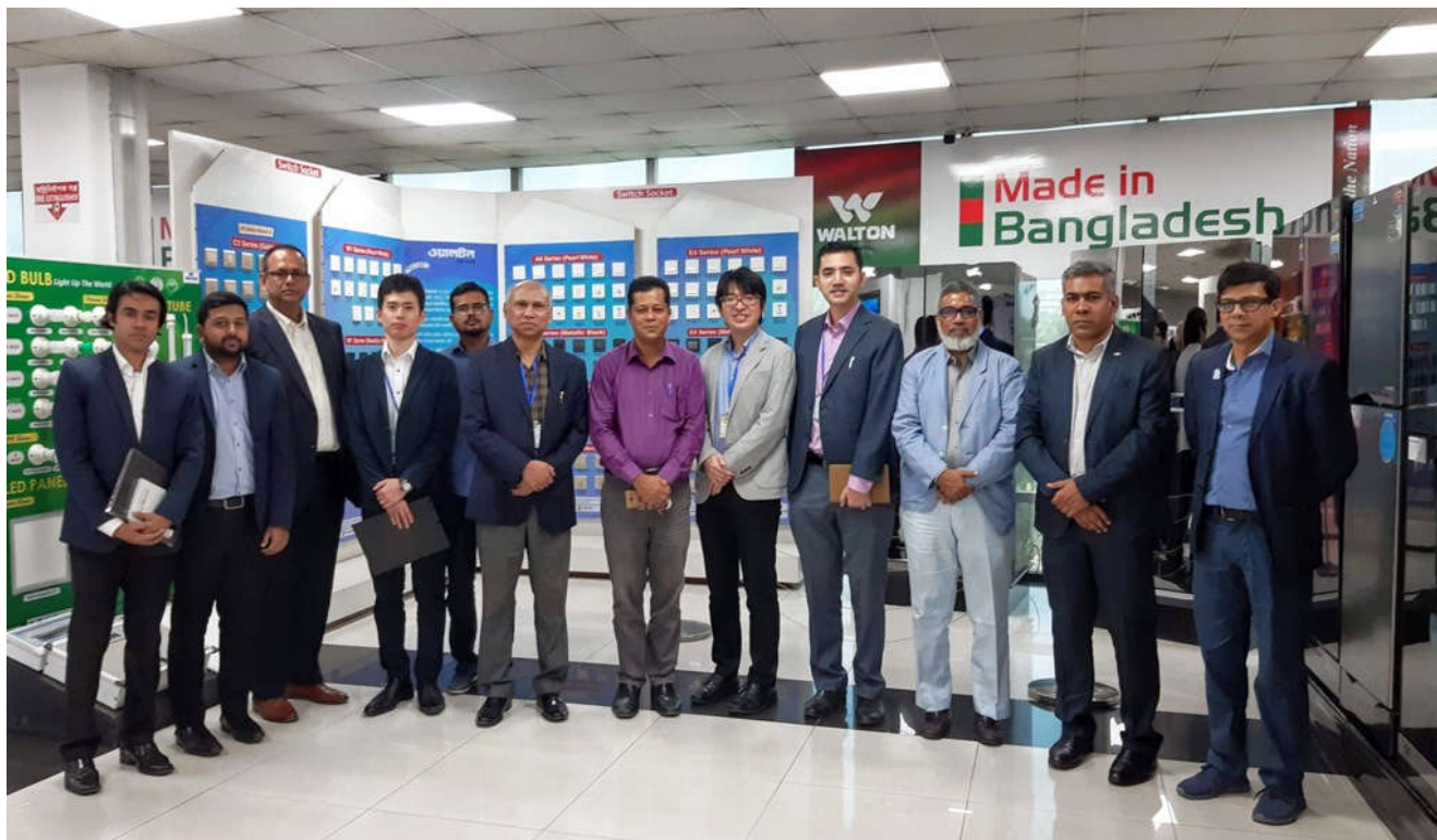
Photo: The JBCCI delegation team took group photos with MD of Walton Hi-Tech Industries Ltd. and at the display center of that premises.