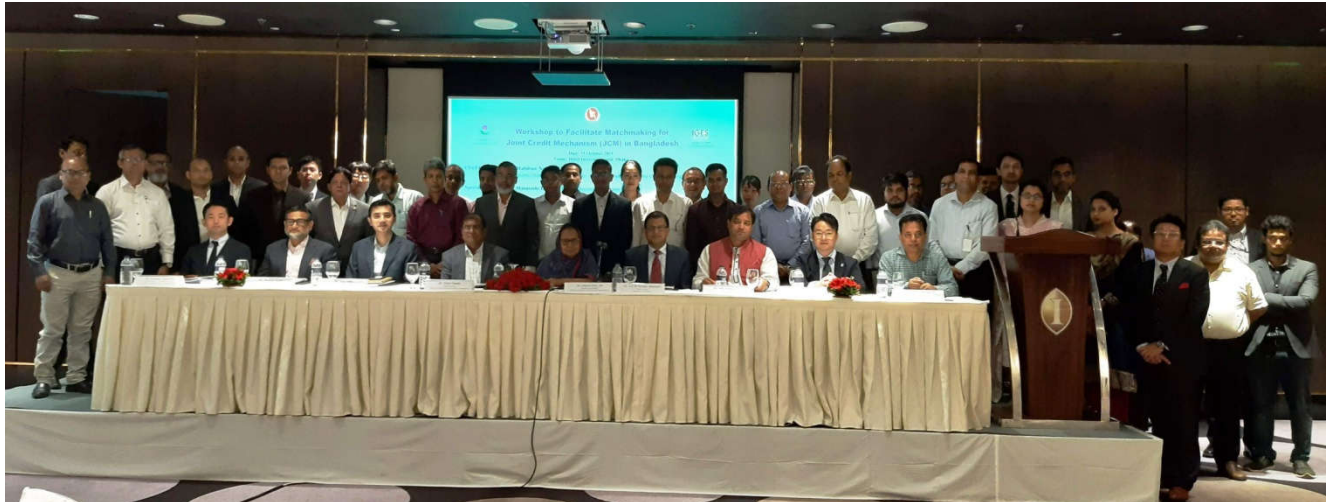
Photo: A group photo was taken during the workshop.

15.10.2019 JBCCI collaborated a workshop on “ Facilitate Matchmaking for Joint Crediting Mechanism (JCM) in Bangladesh ” which was organized jointly by Institute for Global Environmental Strategies (IGES), Japan and Department of Environment, Ministry of Environment, Forest & Climate Change, Bangladesh. It was also supported by the Ministry of Environment of Japan. 78 persons attended this program.