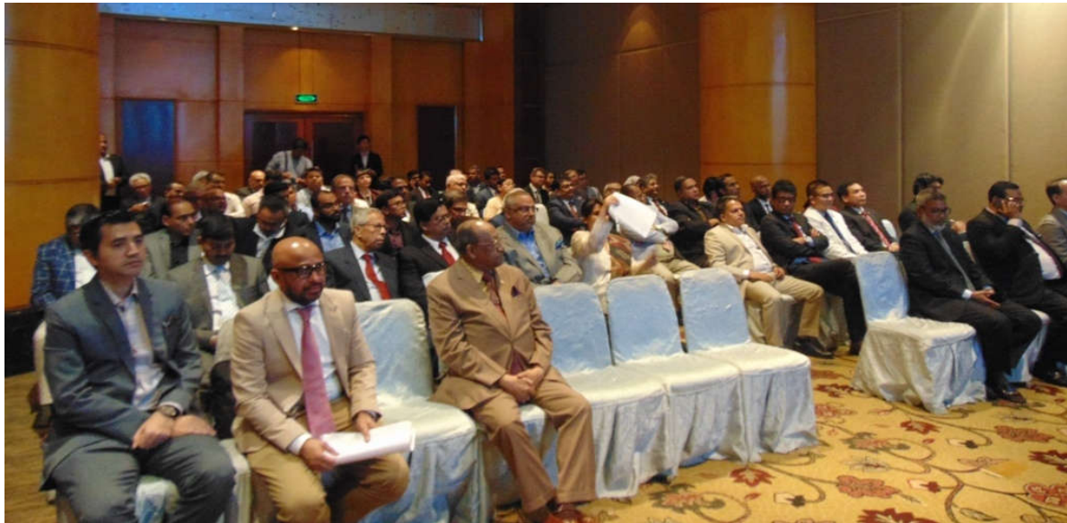
Photo: During the Joint Seminar and Discussion session of JBCCI and CanCham Bangladesh.

01.03.2020 The News Articles on the “Ease of Doing Business in Bangladesh and Networking Dinner Reception” came out in several newspapers on 1 st March, 2020. This was circulated among the members of JBCCI for their kind information.