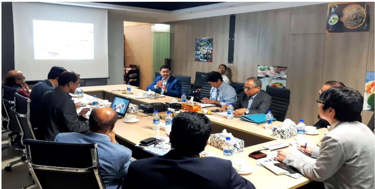
Photo: The Board of Directors discussing on various matters during the 103rd Board Meeting.

20.10.2019 The 103 rd Board Meeting of JBCCI was held at JETRO Dhaka Office at 4:30 p.m.-5:30 p.m. This was attended by 10 Directors.