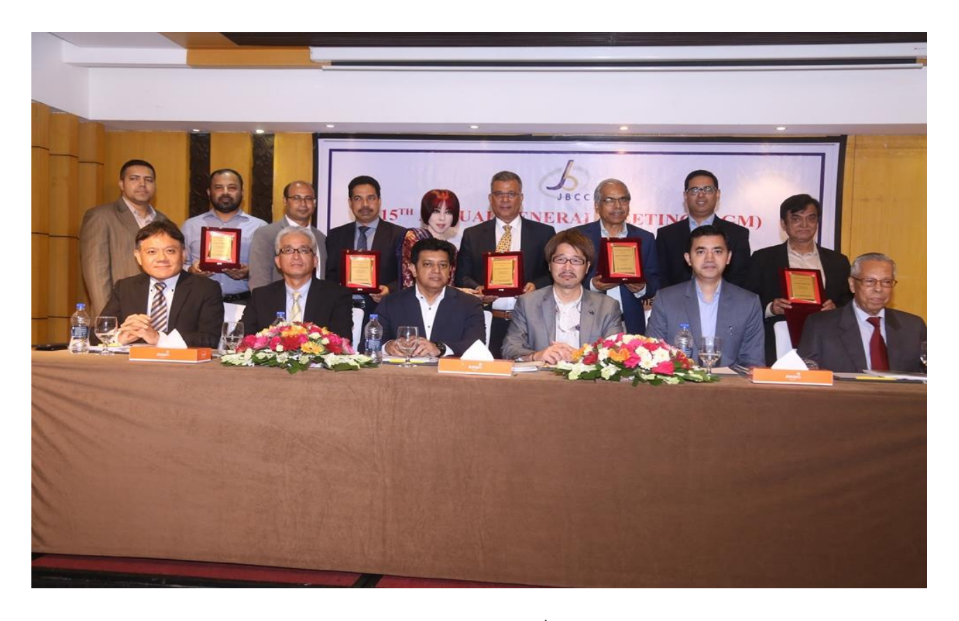
Photo: The group photo of Board of Directors with the winners of 2^{nd} Business Excellence Award in different category.