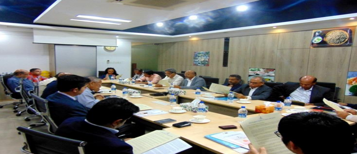
Photo: JBCCI President receiving the book of "Recommendation of Development of SMEs in Bangladesh" from SME Support Standing Committee of JBCCI and also arranged "Meet the Press" regarding this matter.

<u>30.09.2019</u> The News Articles on "JICA's Two Step Loan (TSL) for Foreign Direct Investment Promotion" came out in the Financial Express and the Dhaka Tribune on 25<sup>th</sup> September, 2019. This was circulated among the members of JBCCI for their kind information.