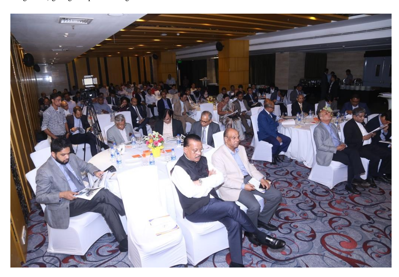
Photo: A view from the 15<sup>th</sup>AGM of JBCCI, during the AGM discussion going on.