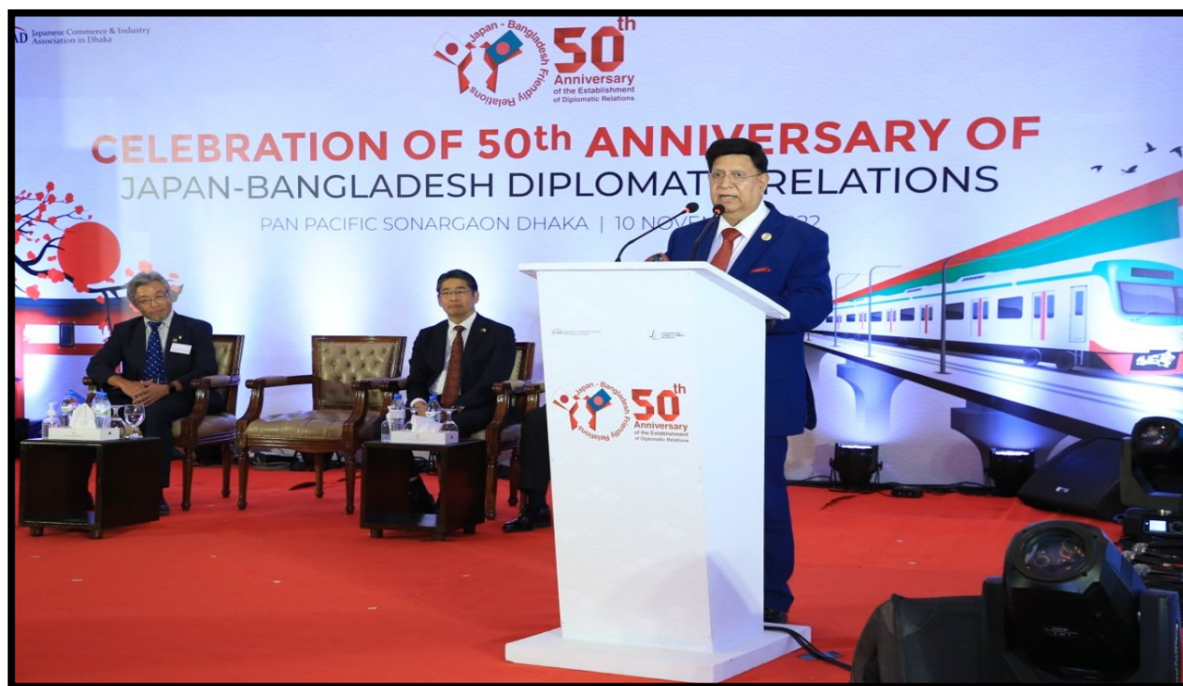
Photo: H.E. Mr. AK Abdul Monem, Hon’ble Minister of Foreign Affairs during his speech-giving session.