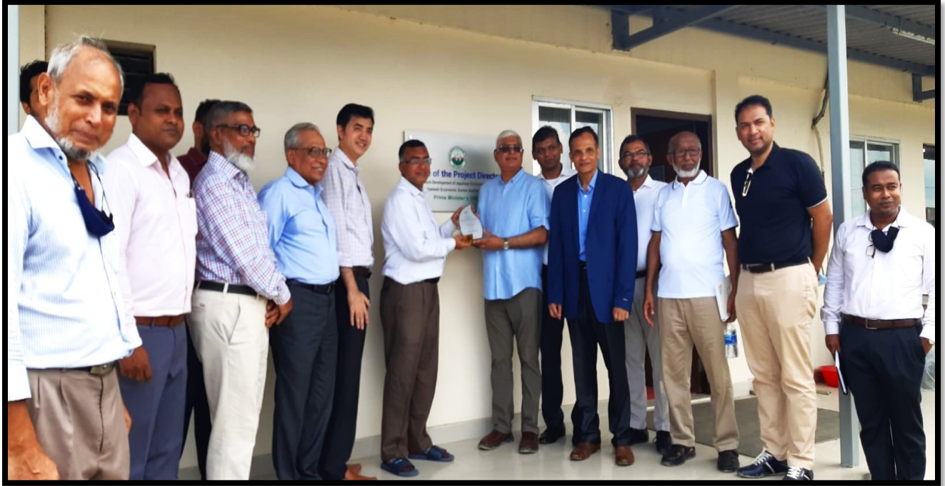
Photo: Views of the 10 th Factory/Project Visit Program at BSEZ, Arai hazar, Narayanganj.

23.07.2022 A Notice on Requesting to pay the Annual Subscription Fee of JBCCI for July 2021-June 2022 was circulated to the unpaid members.