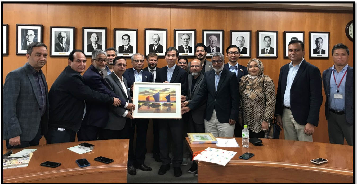
Photo: B2B Delegations at the Osaka Chamber of Commerce and Industry (OCCI) Office in Osaka, Japan.