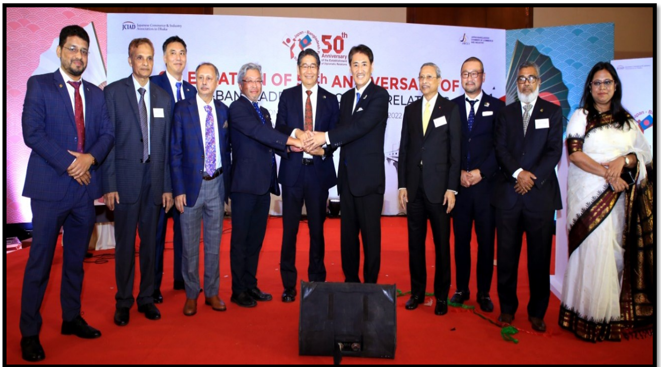
Photo: During the Celebration Program Hon'ble Ambassador of Japan appreciates JBCCI and Shoo-Koo-Kai for the program.