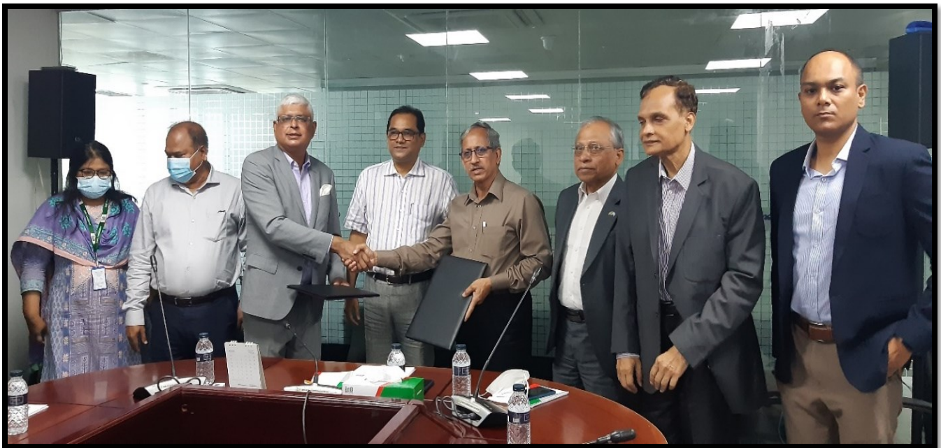
Photo: View of the MoU exchange of SMEF and JBCCI held at SMEF Office, Agargaon.

27.07.2022 A Notice of the Election Schedule of JBCCI Oct 2022-Sep 2024 was circulated.