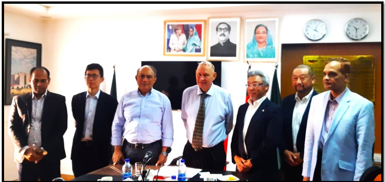
Photo: View of the Meeting with BGCCI at their Head Office.