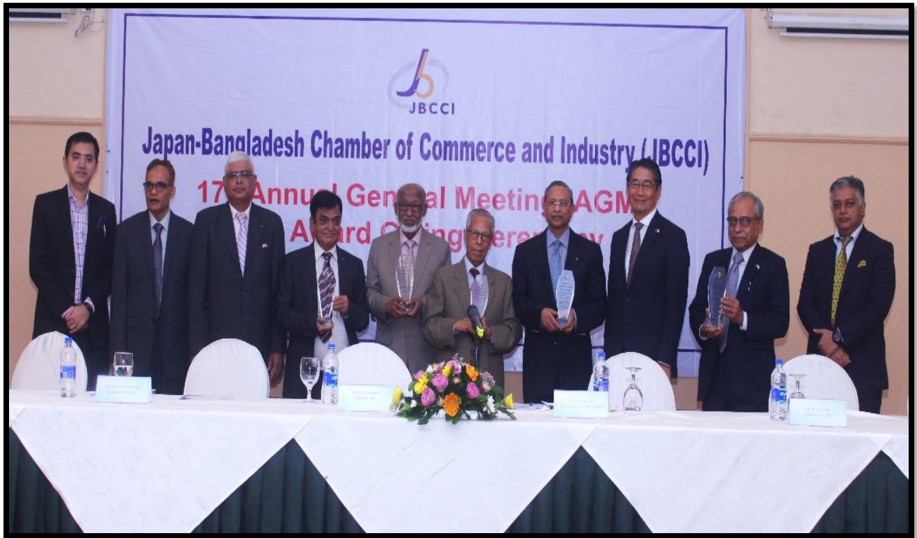
Photo: View of the Salutation of the Recipients of “the Order of the Rising Sun” from the Govt. of Japan.