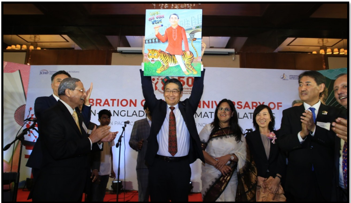
Photo: During the Fare-well ceremony of the Hon'ble Ambassador of Japan and JBCCI & Shoo-Koo-Kai jointly handed over the Souvenir in honor of Hon'ble Ambassador