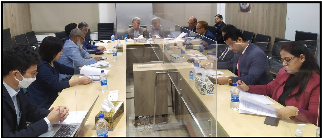
Photo: View of the informal meeting of the board of directors of JBCCI.

22.12.2022 The Informal Meeting of the Board of Directors of JBCCI was held at the JETRO Dhaka office on December 22, 2022 for reviewing the progress on some JBCCI's upcoming programs.