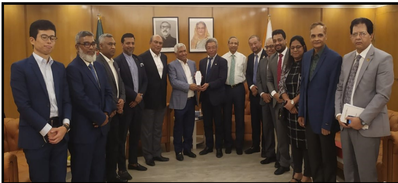
Photo: View of the Courtesy Meeting of JBCCI with FBCCI

06.11.2022 A Courtesy Meeting of JBCCI with FBCCI on Nov 6, 2022.