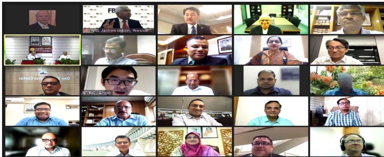
Photo: View of the review meeting of 4 th PPED.