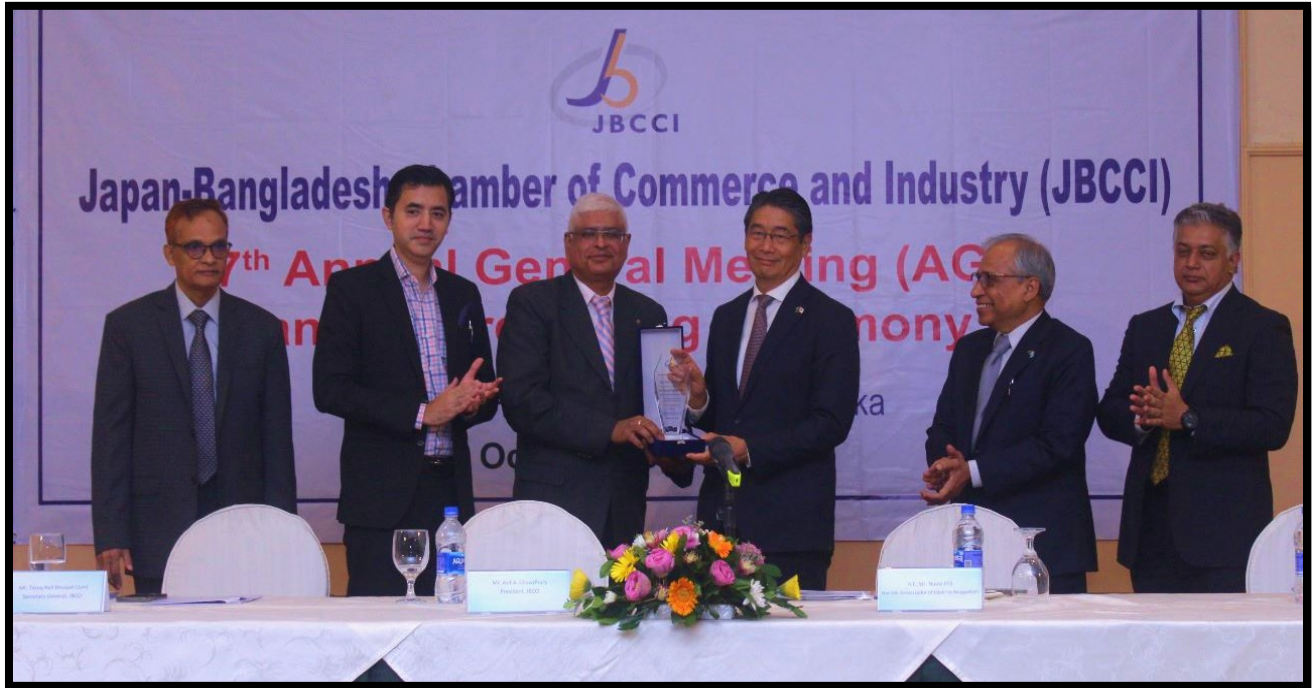
Photo: View of the Salutation to honor H.E. Mr. Naoki ITO, Hon'ble Ambassador for being the Recipient of the “Bangabandhu Medal for Diplomatic Excellence” from the Govt. of Bangladesh.