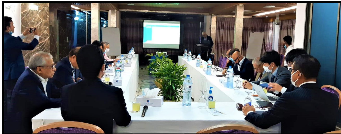
Photo: View of the discussion meeting of JBCCI with the METI Delegation.

09.08.2022 JBCCI arranged a discussion meeting between the Ministry of Economic, Trade, and Industries (METI) Delegation and JBCCI held at Lake Castle Hotel, Gulshan. The purpose of the visit of METI delegation is to assist the Japanese government to prepare a roadmap and coming up with recommendations to face the challenges during the Post-LDC graduation of Bangladesh. The meeting discussed mutual interests, including Industrial upgradation and possible FTA between the two countries.