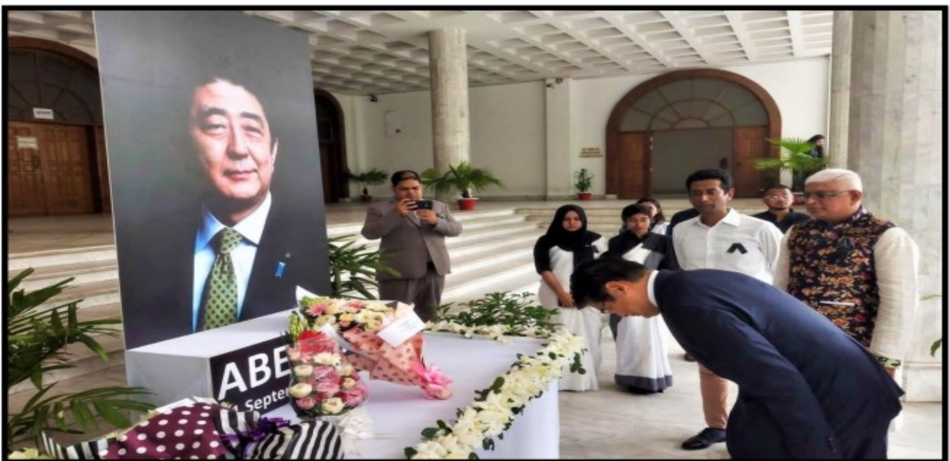
Photo: Views of the condolence program of Dhaka University.

04.09.2022 A Notice of the Postponement of the 11th Factory/Project Visit Program at the MRT Line-6, Uttara, Diabari on September 4, 2022, was circulated to the board of directors.