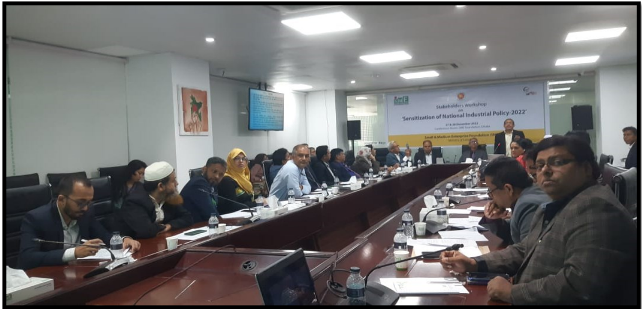
Photo: View of the discussion meeting held at SMEF.

28.12.2022 A discussion program on sensitization of “National Industrial Policy-2022” organize by SME foundation was held at the head office of SMEF. JBCCI official attended the program.