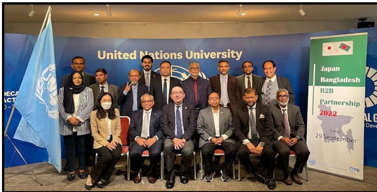
Photo: B2B Delegations at the United Nations University Building in Tokyo, Japan.