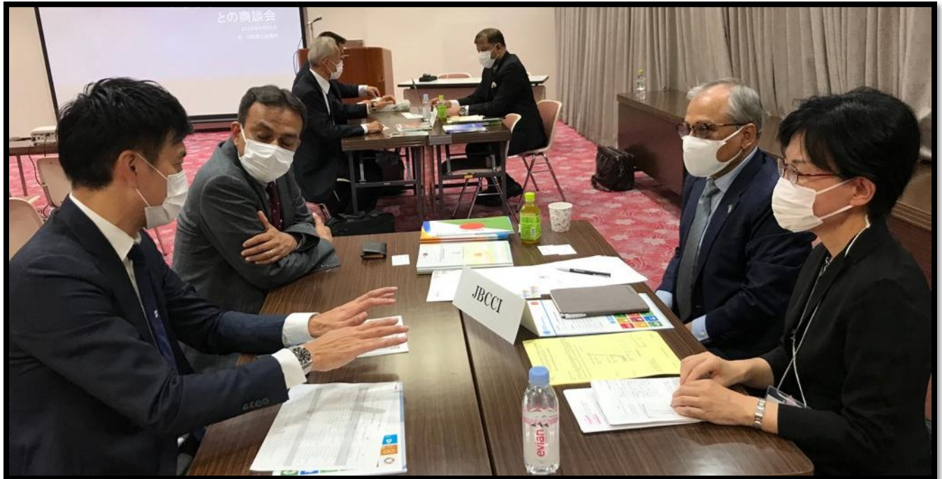
Photo: During the Match-making event and discussion with Japanese Nationals.

of the OCCI and interacted about the possible cooperation between OCCI and JBCCI for the promotion of business between the two countries. JBCCI delegation also had an interactive meeting with the Hon'ble Bangladesh Ambassador and related officials of the Embassy where the mission members exchanged their experiences with the Embassy officials.