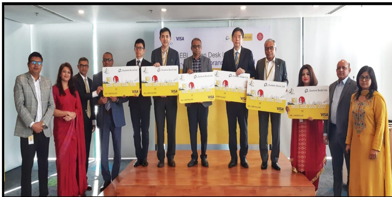
Photo: View of the MoU signing ceremony of EBL and JBCCI.

This Co-brand Credit card will facilitate the members of JBCCI who are involved in Japan-Bangladesh trade and Investments.