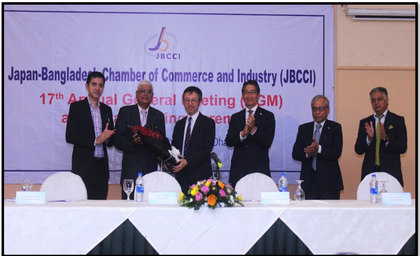
Photo: During the Welcome Reception of the new Minister of EoJ, Mr. Machida Tatsuya by JBCCI.