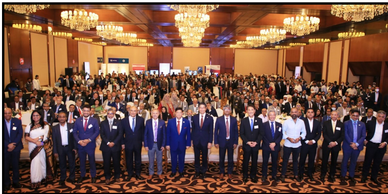
Photo: All invited Guests took the Group Photo at the 50 th Anniversary of the Japan-Bangladesh Friendship Celebration Program.

13.10.2022 The News Articles regarding the 50th Anniversary Reception of Shoo-Koo-Kai & JBCCI held on Nov 10, 2022, organized by JBCCI and Shoo-Koo-Ka. and came out in Bangladesh Post and The Daily Star, The Business Post, The Financial Express, Post newspaper on November 12, 2022, Prothom Alo and The Business Standard, News Age, and UNB newspapers on November 11, 2022. These articles were circulated among the members of JBCCI for their kind information.