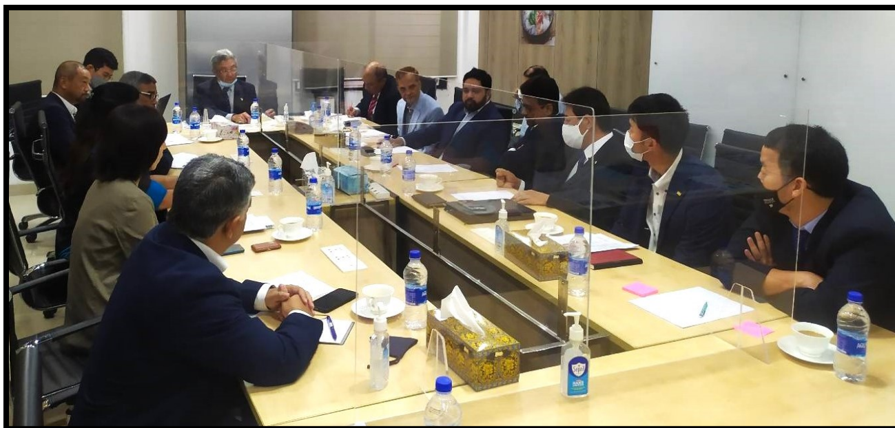
Photo: During the 120 th Board Meeting of JBCCI. The new Board of Directors discussing on matters that they want to work on and achieve during their tenure 2022-2024.

25.10.2022 The 120 th Board Meeting of JBCCI was held at JETRO Dhaka Office. The new Board of Directors attended the Meeting.