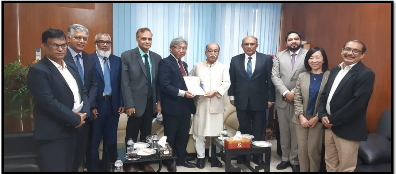
Photo: View of the Courtesy Call meeting of JBCCI on H.E. Mr. Nurul Majid Mahmud Humayun (MP), Hon'ble Minister, Ministry of Industries.

20.12.2022 The News Articles on Courtesy Call on H.E. Mr. Nurul Majid Mahmud Humayun (MP), Hon'ble Minister, Ministry of Industries, held on Dec 18, 2022, came out in Bangladesh Post newspaper on December 19, 2022 and The Jugantor, The Financial Express, Prothom Alo and Samakal, Dhaka Tribune newspapers on December 20, 2022. These articles were circulated among the members of JBCCI for their kind information.