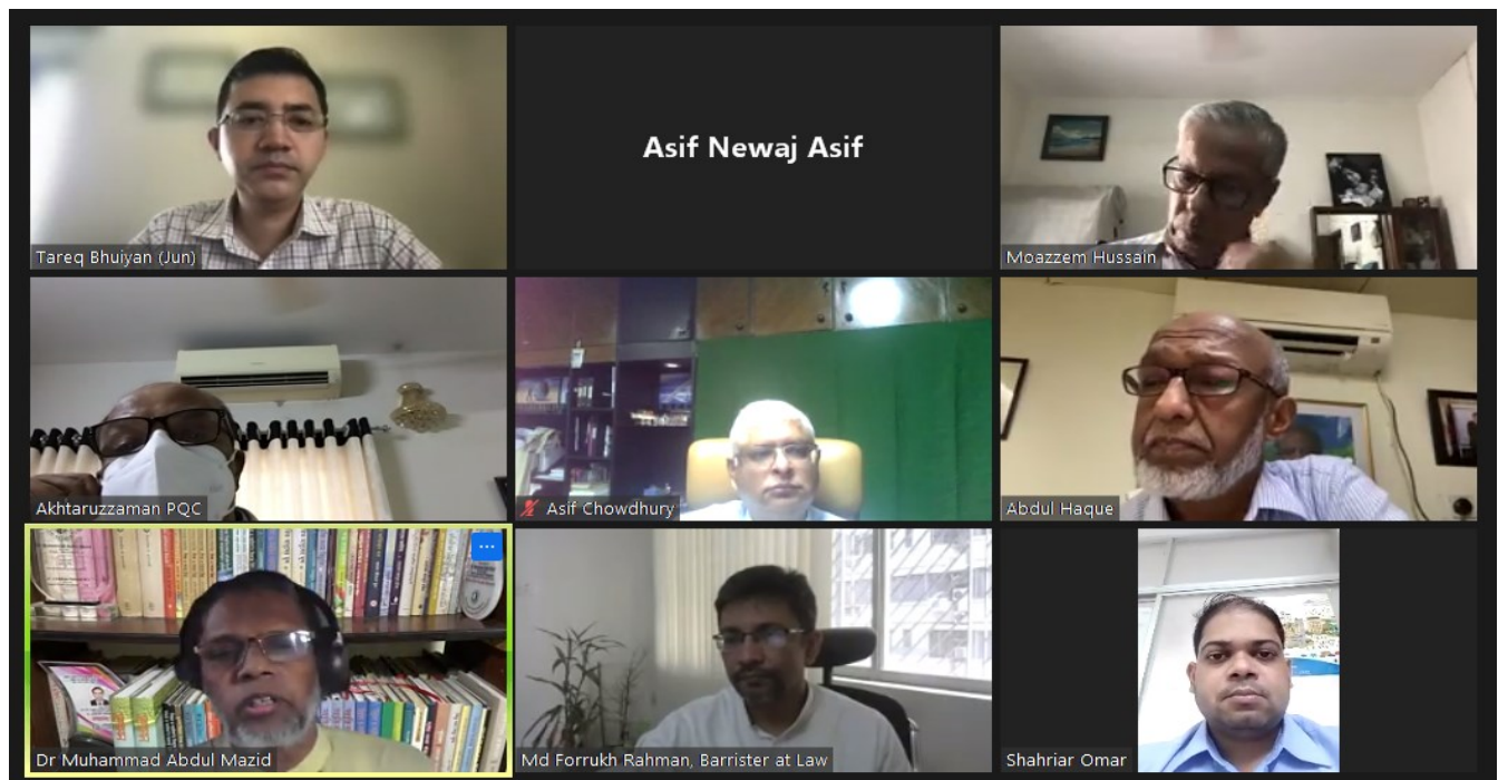
Photo: A view of the Meeting

17.07.2021 The 1 st Meeting of the “Constitution Amendment Committee” of JBCCI was held on 17 th July through a webinar to discuss the points of Amendment for the MoA & AoA of JBCCI.