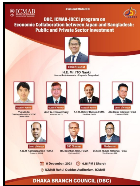
Photo: a view of the banner of the Program

29.11.2021 An invitation circular was sent to the members of JBCCI to attend a Seminar Jointly organized by JBCCI, DBC & ICMAB on 8th December, 2021.