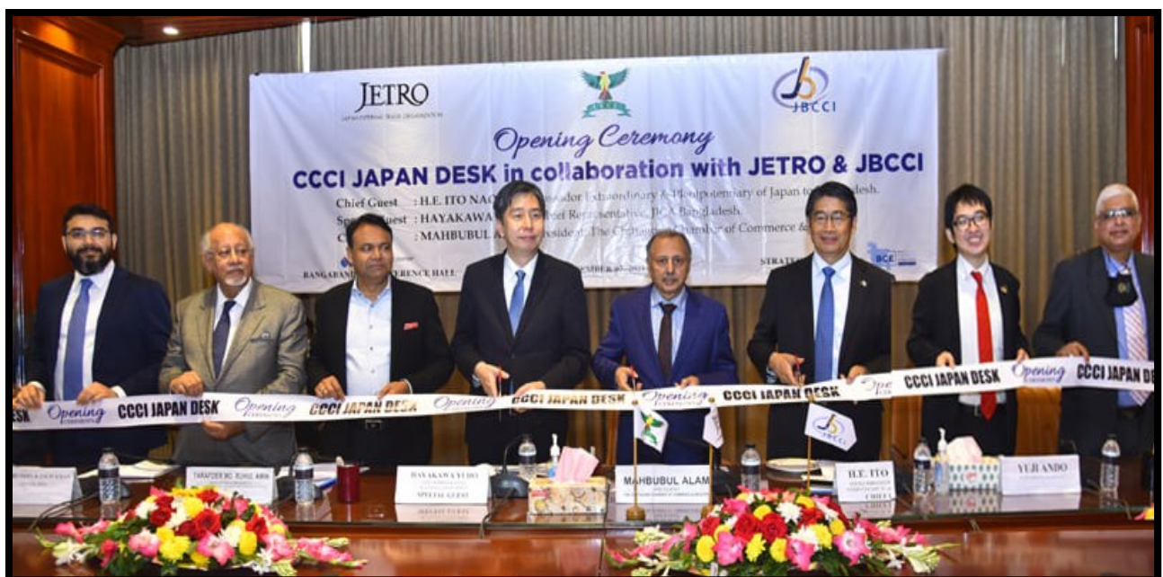
Photo: View of the Japan Desk Inauguration Program