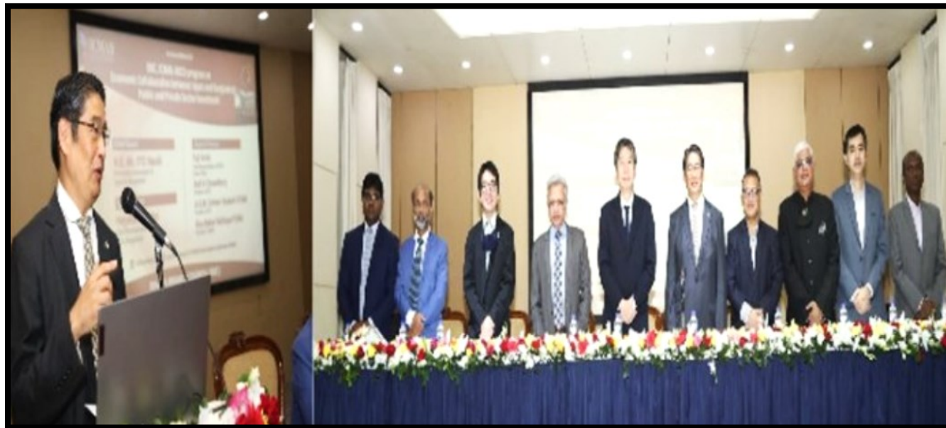
Photo: View of the group picture published in the national dailies.

11.12.2021 The News Articles on “Economic Collaboration between Japan and Bangladesh: Public and Private Sector Investment” jointly organized by JBCCI and DBC of ICMA, held on 8 th December, 2021 came out in several newspapers on 9 th and 10 th December 2021 which was circulated among the members of JBCCI.