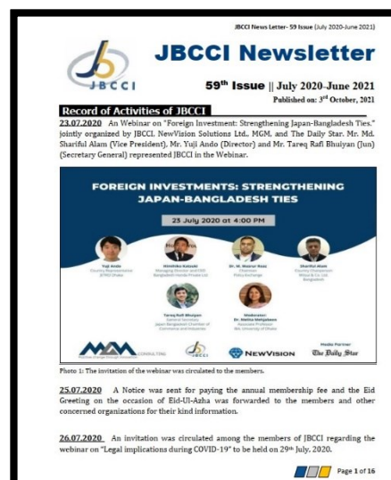
Photo: Front Page of the 59 th Issue-JBCCI Newsletter

03.10.2021 The 59 th issue of the JBCCI Newsletter was e-mailed to the Members of JBCCI and the relevant organizations.