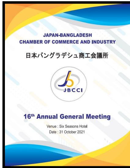
Photo: Cover page of the 16 th AGM Report of JBCCI

09.09.2021 An invitation was sent to the members of JBCCI to publish advertisements in the upcoming Printed AGM & Activities Report of JBCCI FY 2020-2021.